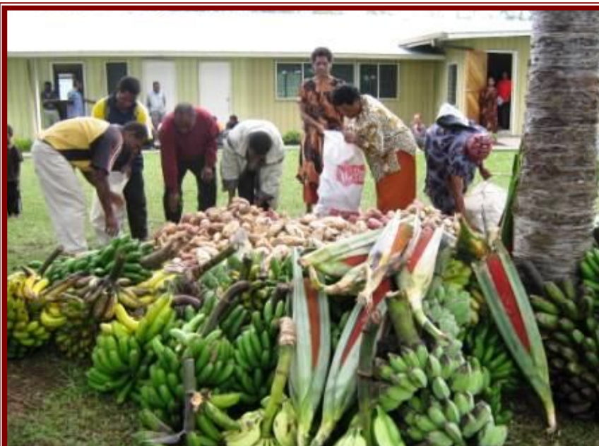
Faculty and staff help divide the fruits and vegetables for distribution.

Culturally, PNG has the belief that the extended family or village will always care for its own. MNBC is pleased that the Church of the Nazarene considers faculty and students as part of their family in PNG.