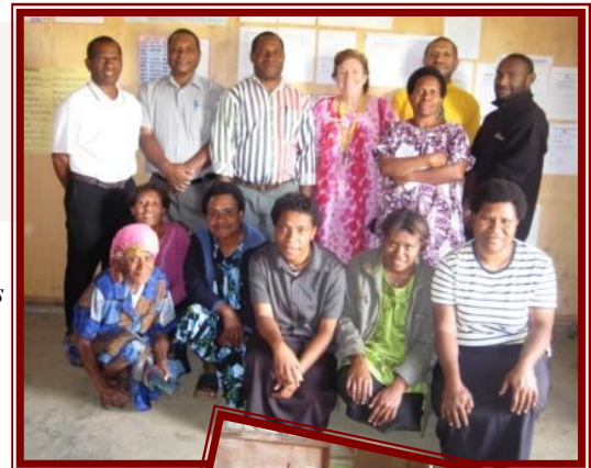
Teachers and Administrators at Lee Eby Primary School and Melanesia Nazarene Bible College.